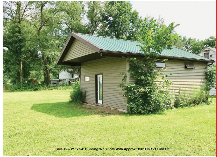
Sale #2 – 21' x 24' Building W/ 3 Lots With Approx. 198' On 121 Linn St.

Auctioneer/Realtor: Gene Kiko, CAI, ext. 112 or 330-495-0041 call/text